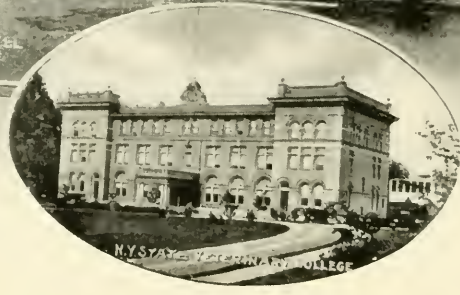
N.Y. STATE VETERINARY COLLEGE